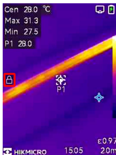
Figure 2-1 Locked Live View Interface