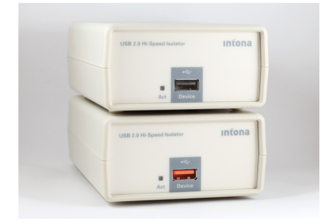
Table 1 Model Types, Ordering Codes and Differences