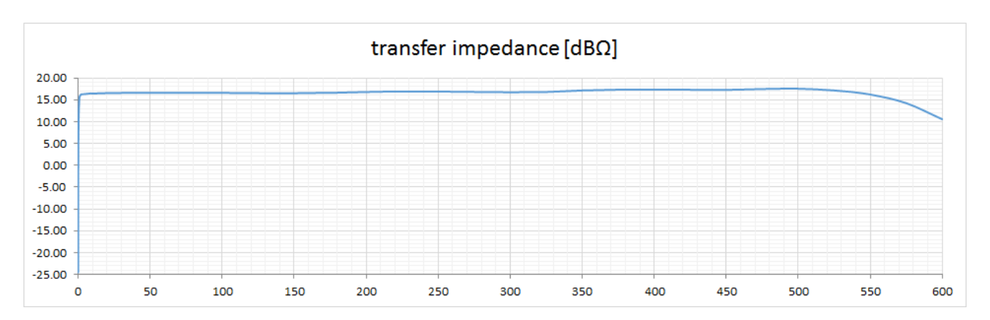
Figure 1: typical transfer impedance: 10 kHz to 600 MHz, linear