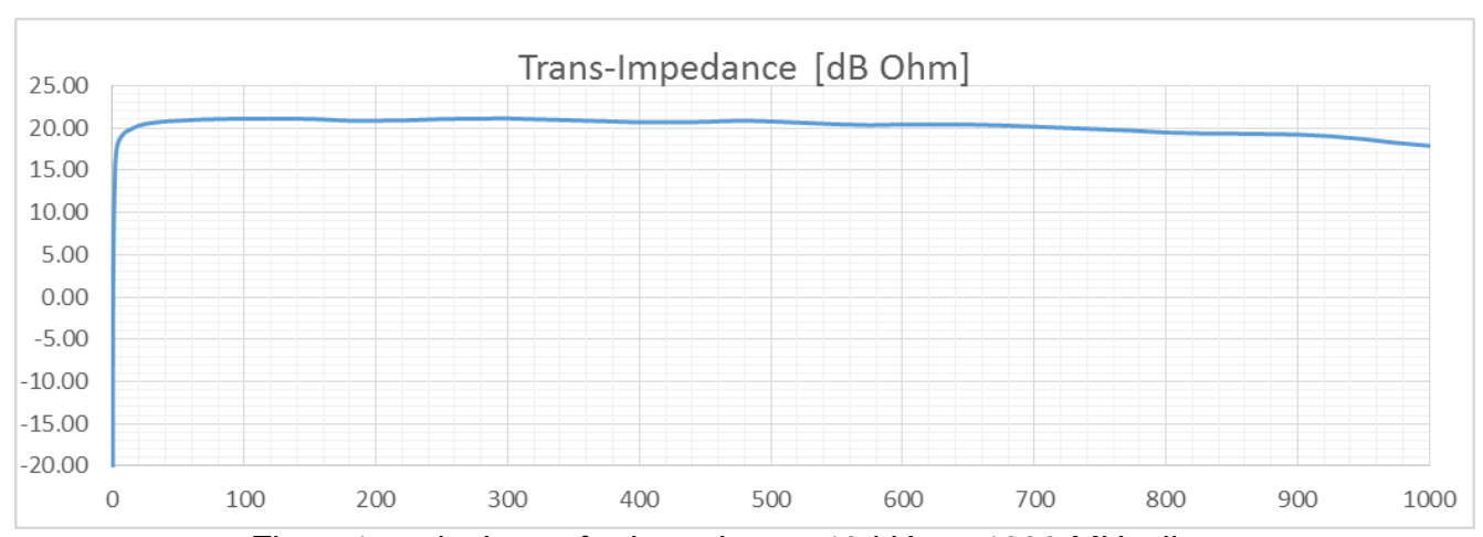
Figure 1: typical transfer impedance: 10 kHz to 1000 MHz, linear