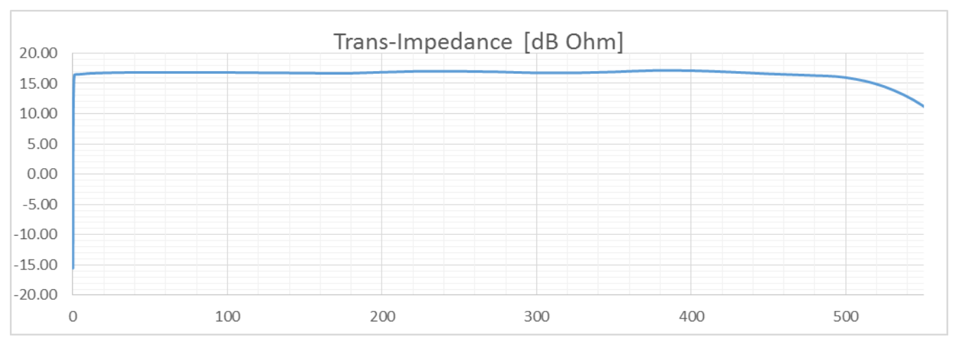
Figure 1: typical transfer impedance: 10 kHz to 550 MHz, linear