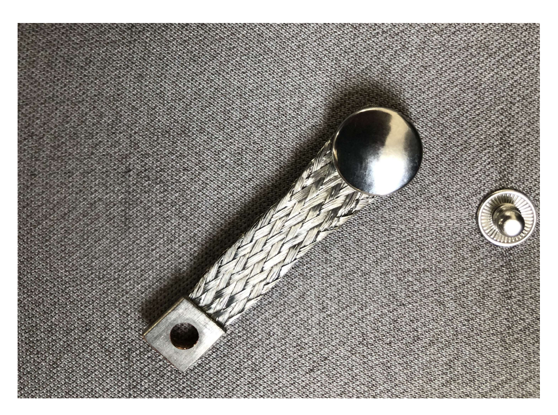
Picture 3: using textile rivets to establish electrical contact to the ground plane

The photo below shows an example, using rivets from a low cost textile riveting set along with a woven ground strap. The ground strap is clamped in between the two halves of the female rivet.